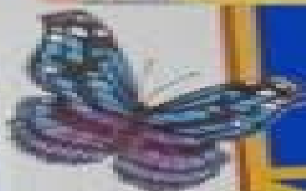
Butterfly Book of Games Page 100