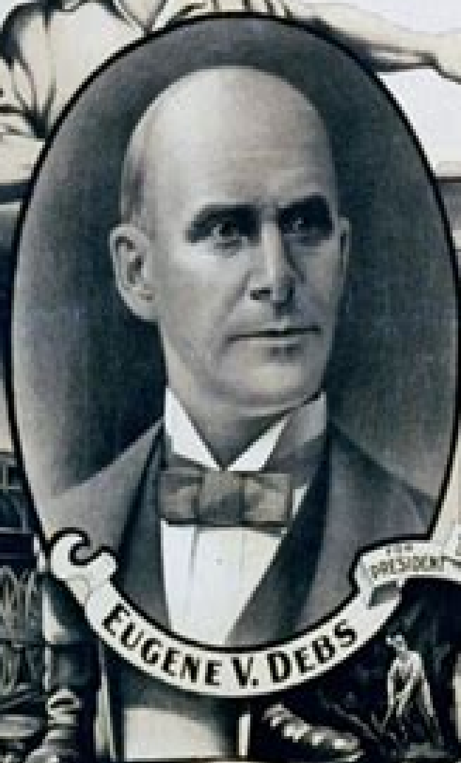
EUGENE V. DEBS