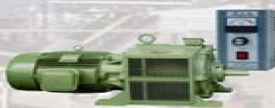
Eddy Current Motor