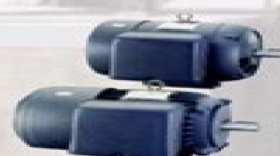
Single Phase Motor