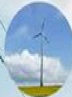
Electricity from wind energy