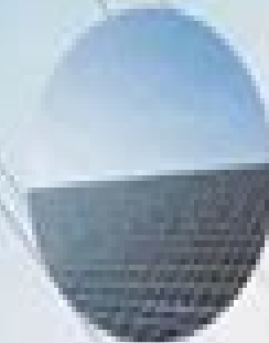
Electricity from solar energy