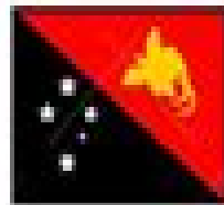
Papua New Guinea