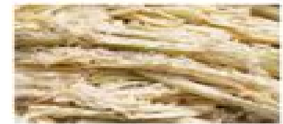
Sugar production by-products