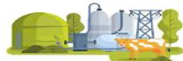
Biogas production application