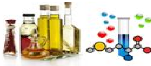
Food application (production of vinegar, oil, edible coatings, and bioactive compounds)