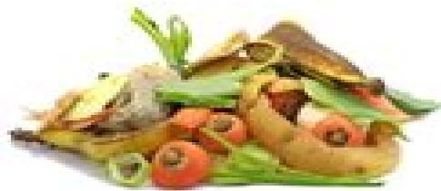
Fruit and vegetables waste