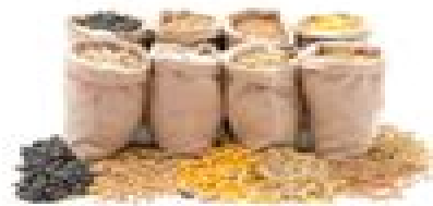
Cereals, nuts, and seeds by-products