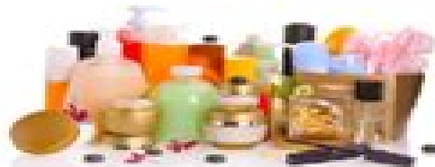
Cosmetics, pharmaceuticals, and chemicals products