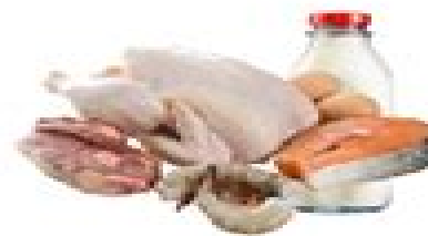
Meat, dairy, fish, and egg by-products