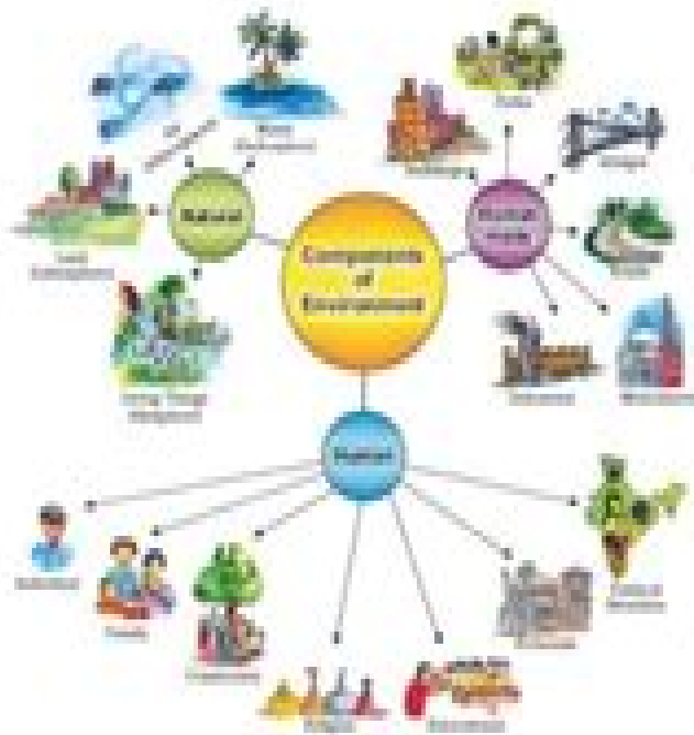
Fig. 1 Components of Environment (Source: NCERT Class VII)

Best for BA , MA in geography, ugc net jrf and other competitive exams.