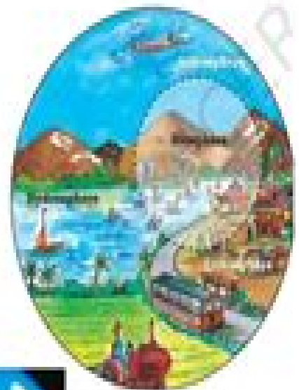
1.2) Structure of the Environment