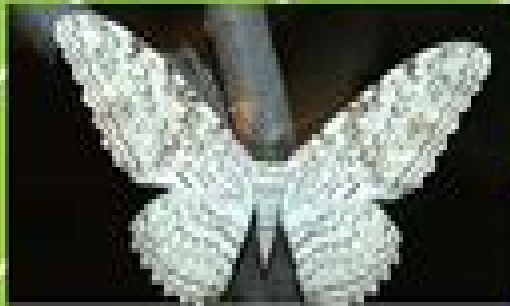
WHITE WITCH MOTH