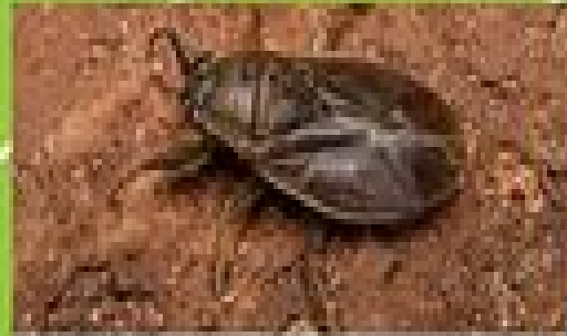
GIANT WATER BUG