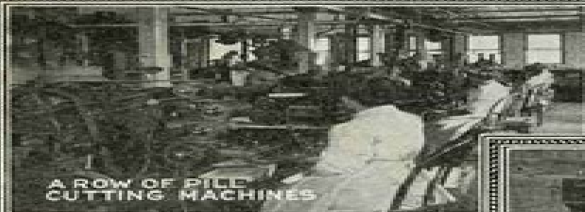
A ROW OF PILL CUTTING MACHINES