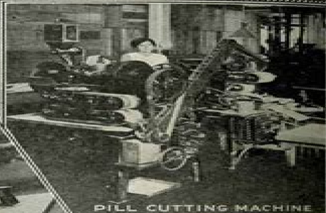
PILL CUTTING MACHINE