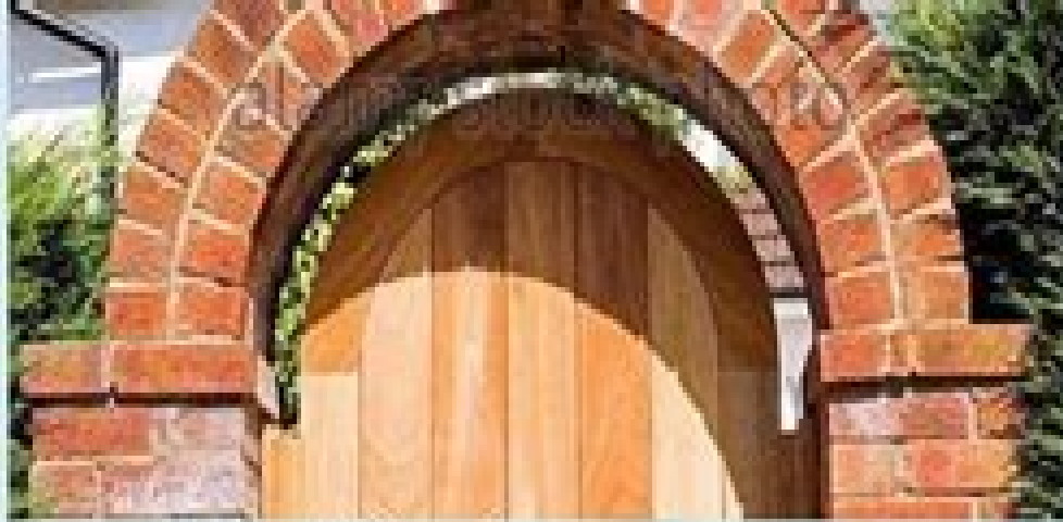
वक्राकार चिनाई (Circular Brick work)