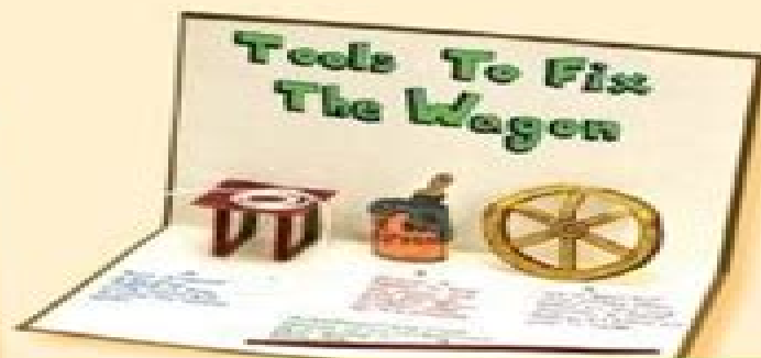
Pioneer Pop-Up Trunk