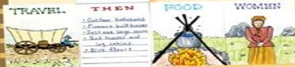
Trail of Tears Story Scrolls