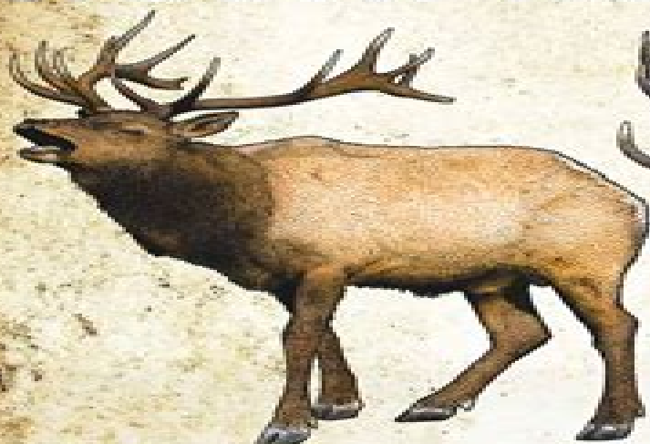
TULE ELK ( Cervus canadensis nannodes ) Range: Central California Conservation status: Vulnerable