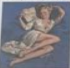
White Dress (Whitout) Model 1950, Gil Elvgren, Pin-up Art

October | Oktober | Octobre | Október | 10/1