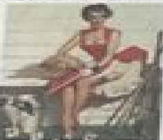
Red Dress (Redout) Model 1950, Gil Elvgren, Pin-up Art