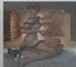
Red Dress 1950, Gil Elvgren, Pin-up Art

November | Noviembre | Novembere | Novemvár | 11/1