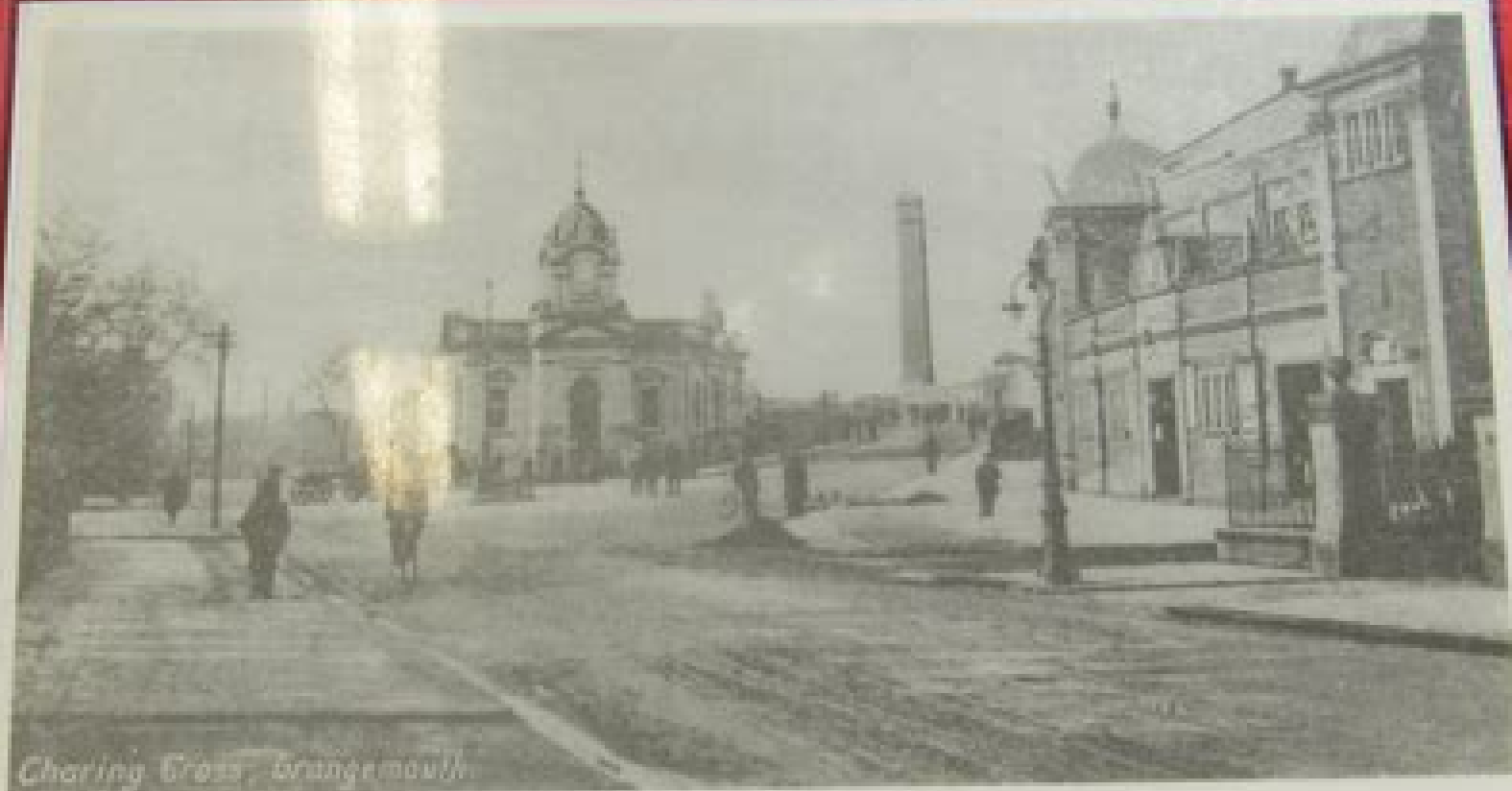
Charing Cross, Grangemouth.