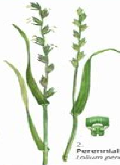
2. Perennial Rye-grass Lolium perenne ●