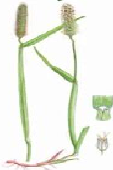
6. Meadow Foxtail Alopecurus pratensis