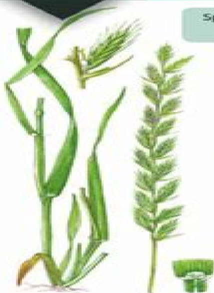
1. Italian Rye-grass Lolium multiflorum

Species marked ● are often found in playing fields and lawns.