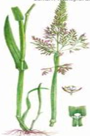
5. Yorkshire Fog Holcus lanatus