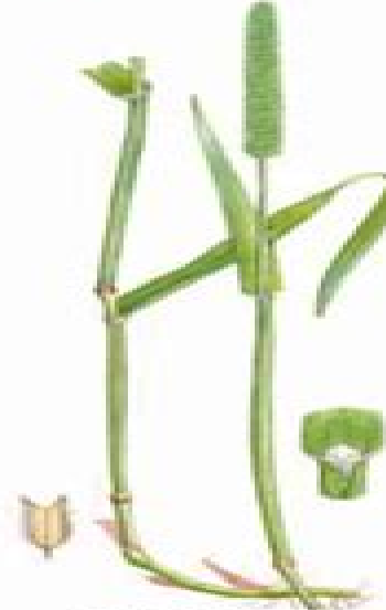
7. Timothy Phleum pratense ●