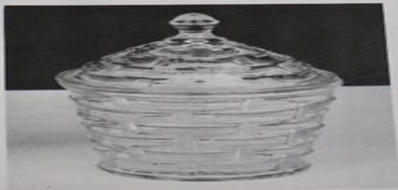
Bamboo Beauty covered sugar bowl.