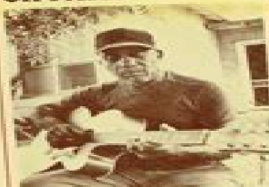
Key of G.