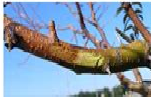
Sapwood under the bark is stained reddish brown below a fire blight canker