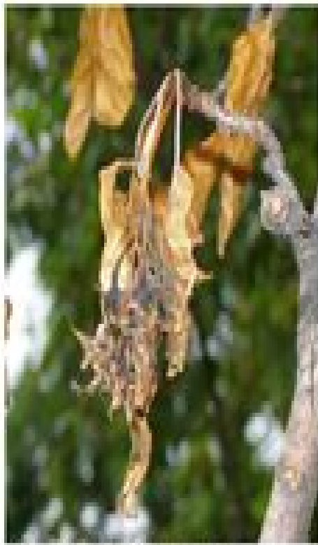
Fire blight infected blossoms