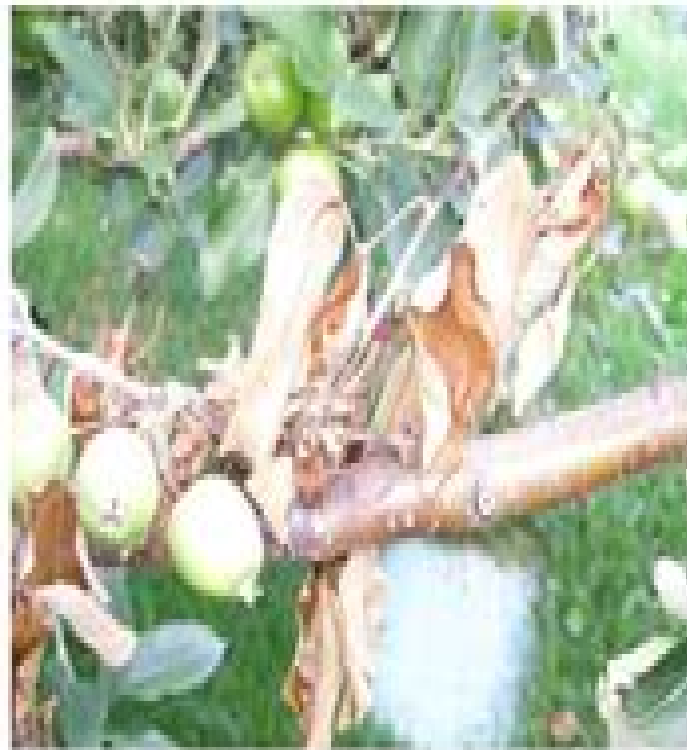
Wilted shoot forming the characteristic hook