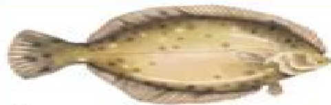
Pleuronectes americanus (winter flounder)