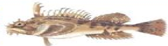
Hemitripterus americanus (sea raven)