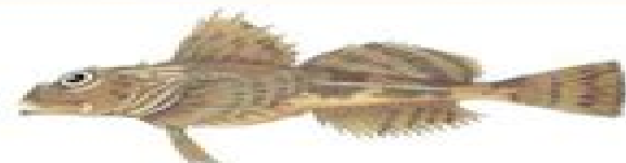
Myoxocephalus octodecemspinois (longhorn sculpin)