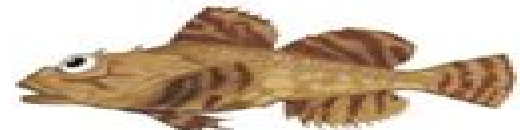
Myoxocephalus scorpius (shorthorn sculpin)