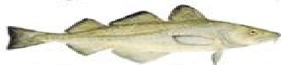
Gadus morhua (Atlantic cod)