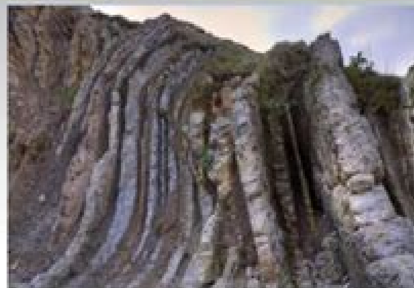
Геодинамика и магматизм

Приведены данные и обобщены различные тектонические факторы, объясняющие наличие в платформе геодинамическую полноту в эволюции Земли, вступлении Загрос-Кавказского сегмента в континентальную субдукцию в связи с включением ее в складчатый бассейн Месопотамия, разлитием в основании вулканоглутионических покровов и метасубдукционной проэкспозиции палеогенового магматизма, который по распространности и спектру рудных элементов значительно превосходит островной магматизм архейства. Доказано, что на трех континентальных этапах развития сегмента давление и надвижение расположенных литосферы по плоскостям срывов в зоне глубинных разломов не являются субдукционными процессами. Рассмотрены также прикладное значение геодинамических исследований в формировании геологических рудно-магматических и нефтегазовых систем. Предлагается глубинно-фронтальное прохождение углеводородов, вследствие структурно-геодинамической полноты распространения магматического поля со зрелой континентальной корой в центральной части и молодой морфологической бассейнов с разорванной корой на фронтальной окраине геологическим поясом Загрос-Кавказского сегмента. Для построения широтного профиля, студента и преподавателя вузов.