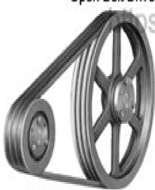
V Belt Drive