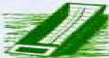
interior of horse