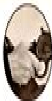
RELIABLE IN ALL WEATHER CONDITIONS