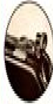
EXTRA STRENGTH ACTION