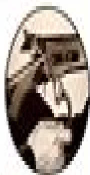
EXTRA STRENGTH ACTION