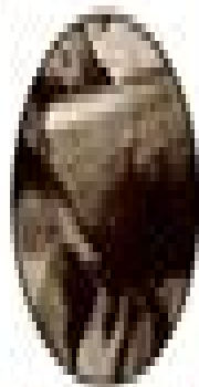
EXTRA STRENGTH ACTION