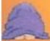
el trapero trapezista