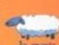
la oveja oveja