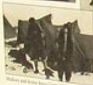
Mallory and Irvine (possibly) lying 22,000 feet on Everest