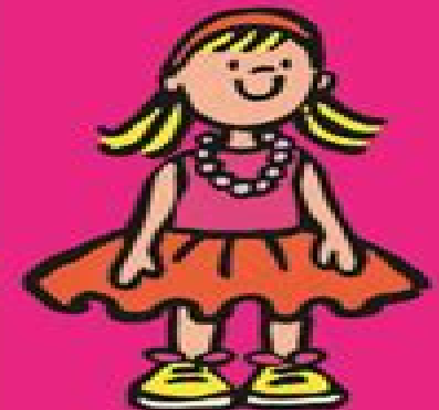
girl la niña