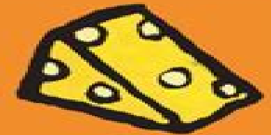
cheese el queso