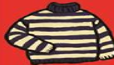
sweater el suéter