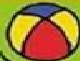
ball an Rothróid