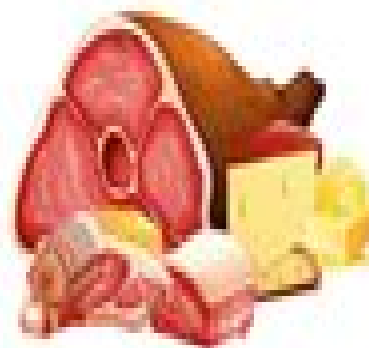
Meats & Fishes