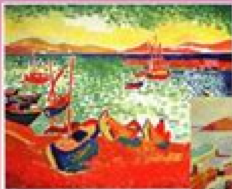
Andre Derain - Boats (1905)