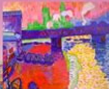
Andre Derain - Charing cross bridge (1905)