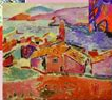
Henri Matisse - View of St. Tropez (1904)