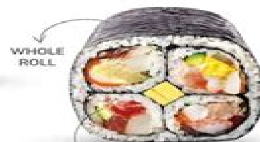
SEVEN DIFFERENT FILLINGS, EACH REPRESENTING ONE GOD OF FORTUNE