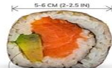
4 OR MORE FILLINGS