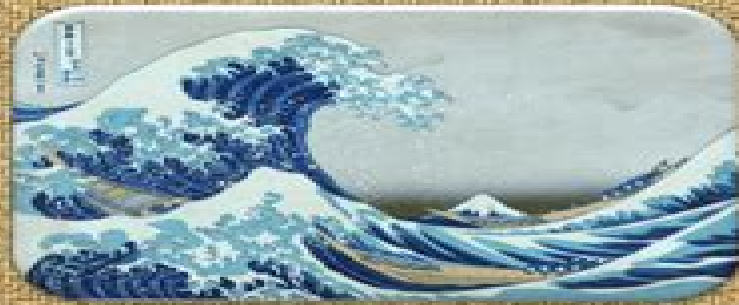
Great Wave by Kanagawa