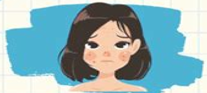
PROBLEMAS DE PIEL