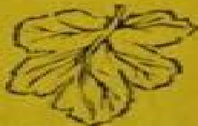
TROPIC OF CANCER