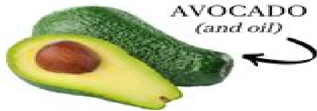
AVOCADO (and oil)