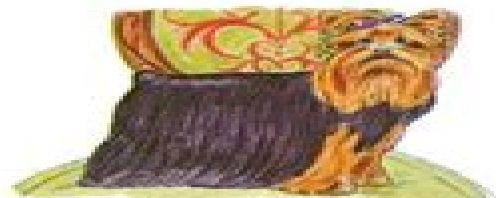
32. Yorkshire Terrier