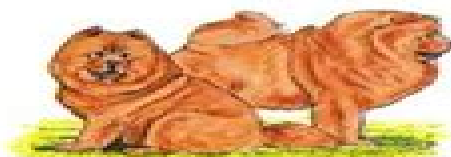
36. Chow Chow