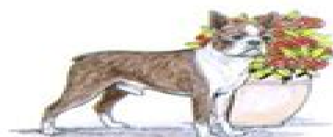
34. Boston Terrier