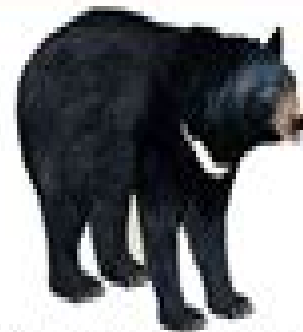
Asian Black Bear