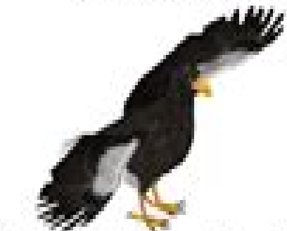
Steller's Sea Eagle