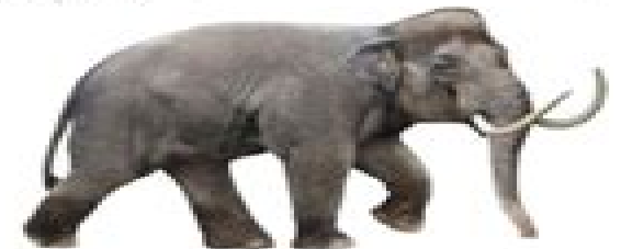
Cretan Dwarf Mammoth ( Mammuthus creticus )