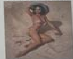
Black Dress 1950, Gil Elvgren, Pin-up Art

September | September | Septembre | Szeptember | 9/09