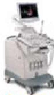
Ultra sound machine