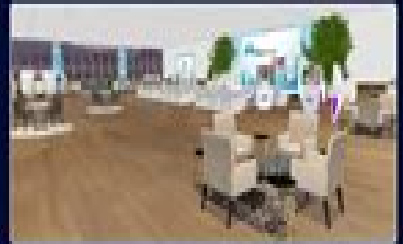
The metaverse and education