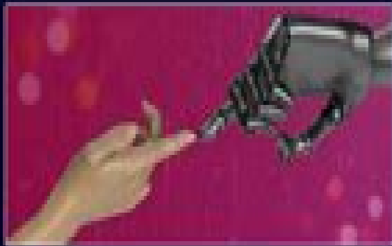
AI-powered learning tools