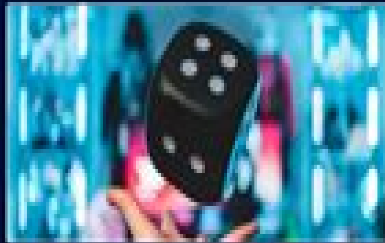
Gamification of learning