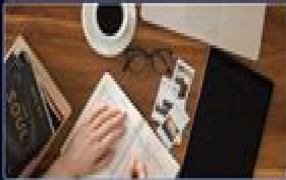
Customized learning paths