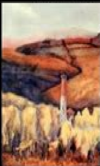
FOREST ON THE HILL