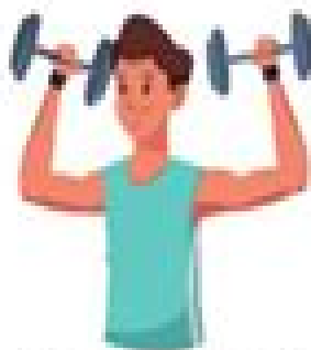
Entrenamientos de fuerza