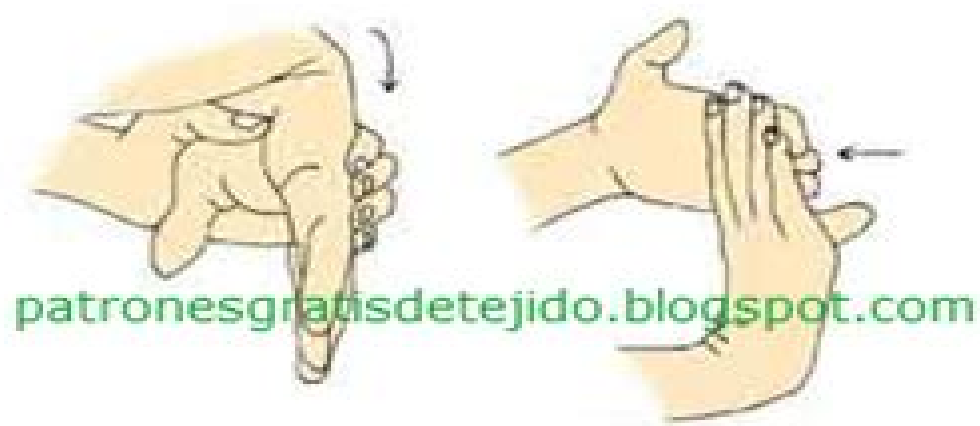
Estiramiento de muñeca