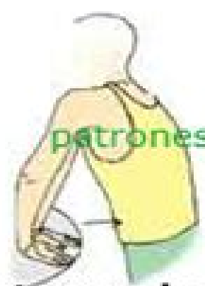
Flexión del tramo de muñeca