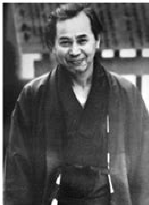
Haruchika Noguchi 1911-1976

❖ Descubre la estructura del movimiento espontáneo (primera mitad s. XX).