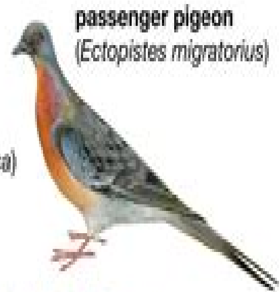
passenger pigeon ( Ectopistes migratorius )