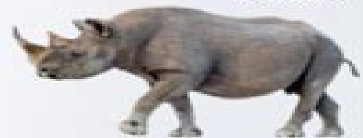
West African Black Rhinoceros