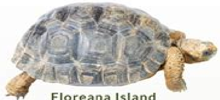
Floreana Island Giant Tortoise