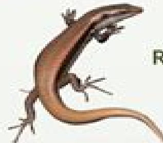
Cape Verde Giant Skink