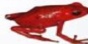
Splendid Poison Frog