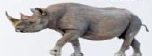
West African Black Rhinoceros