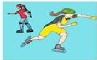
Aggressive inline skating