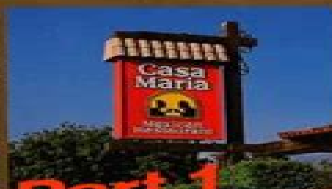
Part 1 Facades and Signboards in the U.S.