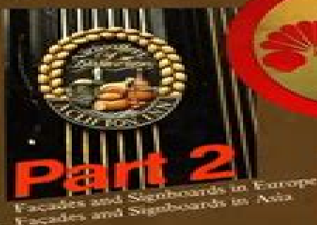
Part 2 Facades and Signboards in Europe Facades and Signboards in Asia