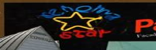
Part 3 Facades and Signboards in Japan